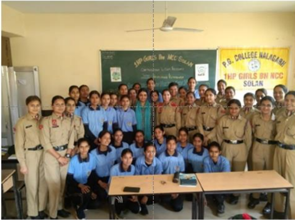
Rally and Tree Plantation 22/07/2023