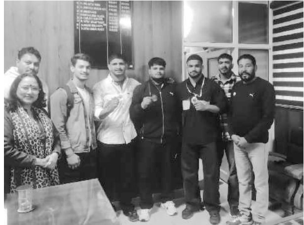
RUNNER UP WUSHU TEAM