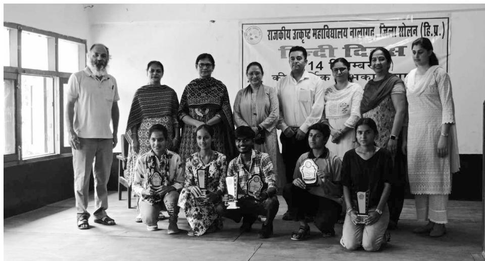
SEMINAR ON DRUG ABUSE

Hindi Divas was celebrated in the college on 14th Sep. 2023. On this day various competitions like Debates and Poetry Recitation were organized and the students were made aware about the importance of Hindi Language. The winners were awarded at the function.