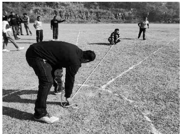
COLLEGE ATHLETICS MEET