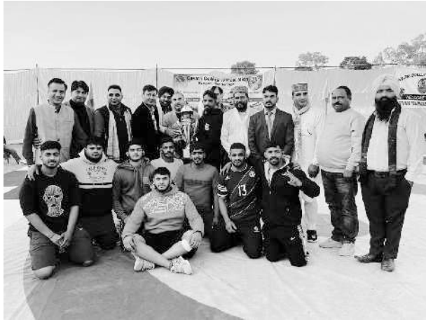
WINNER CHAMPIONSHIP IN INTER COLLEGE WRESTLING (M) CHAMPIONSHIP HELD AT MLSM SUNDERNAGAR.