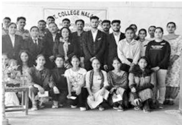
CSCA OATH TAKING (2023-24)