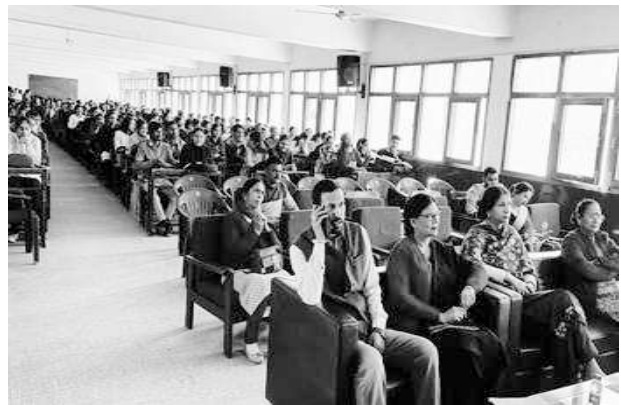
SEMINAR ON DRUG ABUSE