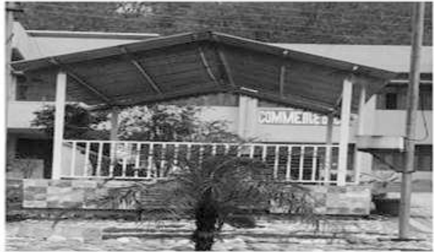
CAMPUS BEAUTIFICATION DONE BY OSA